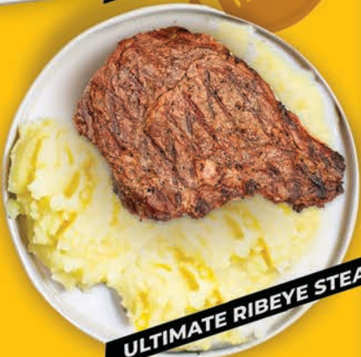
ULTIMATE RIBEYE STEAK