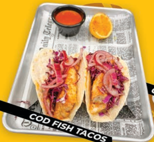
COD FISH TACOS

Two grilled or breaded shrimp tacos, red onions, red cabbage, lime, and a side of butter. 15.99