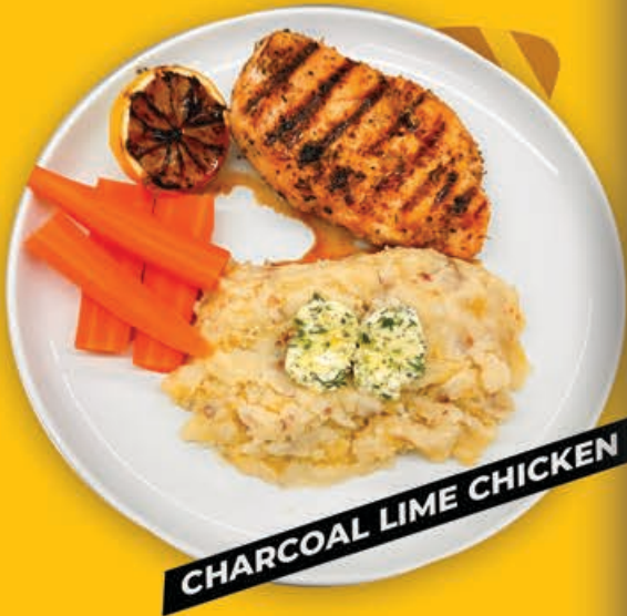
CHARCOAL LIME CHICKEN