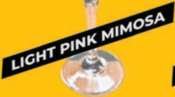
LIGHT PINK MIMOSA