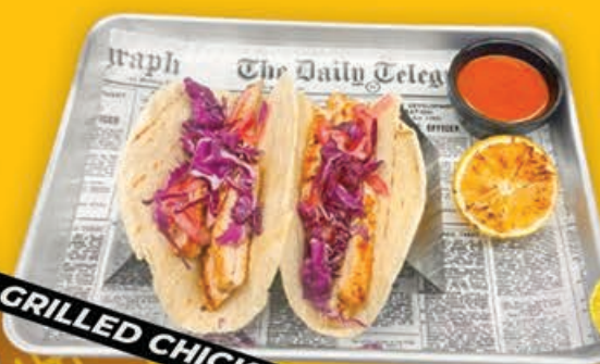
GRILLED CHICKEN TACOS