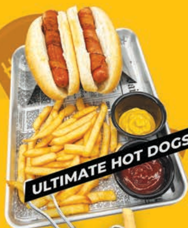
ULTIMATE HOT DOGS

Chicken breast with romaine lettuce, and caesar dressing. Served with a full hand of salted chips. 10.99