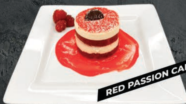
RED PASSION CAKE