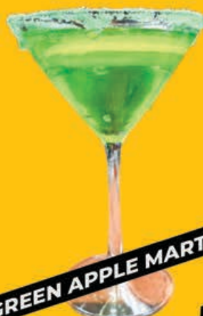
GREEN APPLE MARTINI