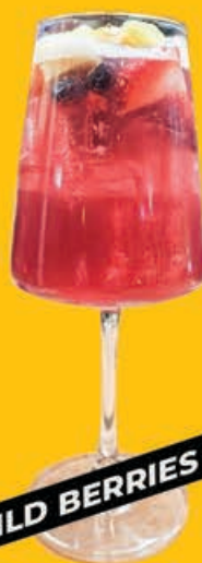
WILD BERRIES SANGRIA