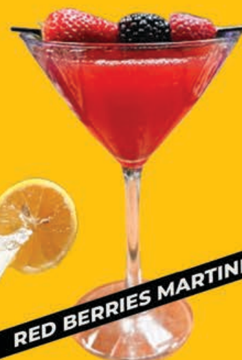
RED BERRIES MARTINI

*THESE ITEMS CAN BE COOKED TO ORDER. CONSUMING RAW OR UNDERCOOKED MEAT, POULTRY, SEAFOOD, SHELLFISH OR EGGS MAY INCREASE YOUR RISK OF FOODBORNE ILLNESS. PLEASE INFORM YOUR SERVER IF YOU HAVE ANY FOOD ALLERGIES.