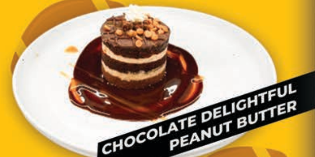
CHOCOLATE DELIGHTFUL PEANUT BUTTER