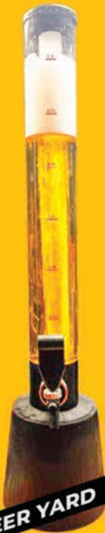
BIG BEER YARD