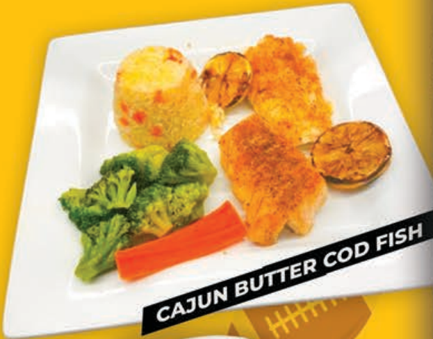
CAJUN BUTTER COD FISH