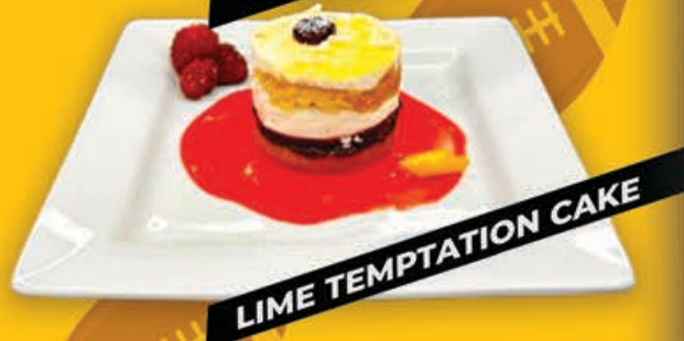
LIME TEMPTATION CAKE