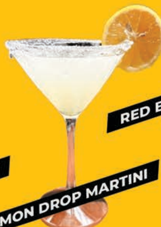
LEMON DROP MARTINI