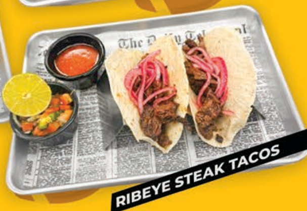
RIBEYE STEAK TACOS

*THESE ITEMS CAN BE COOKED TO ORDER. CONSUMING RAW OR UNDERCOOKED MEAT, POULTRY, SEAFOOD, SHELLFISH OR EGGS MAY INCREASE YOUR RISK OF FOODBORNE ILLNESS. PLEASE INFORM YOUR SERVER IF YOU HAVE ANY FOOD ALLERGIES.